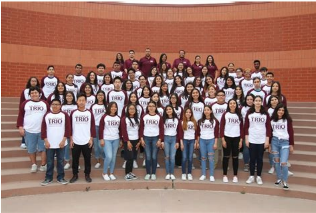
Cal state la financial aid email. Cal state la financial aid email address.